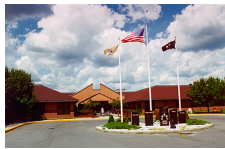
Memorial Home at Paramus 1 Veterans Drive, PO Box 608 Paramus, NJ 07653-0608 (201) 634-8525

The New Jersey Department of Military and Veterans Affairs manages three state-of-the-art long-term nursing facilities.