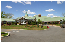
Memorial Home at Menlo Park 132 Evergreen Road, PO Box 3013 Edison, NJ 08818-3013 (732) 452-4102