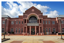
Memorial Home at Vineland 524 North West Blvd Vineland, NJ 08360-2895 (856) 405-4200