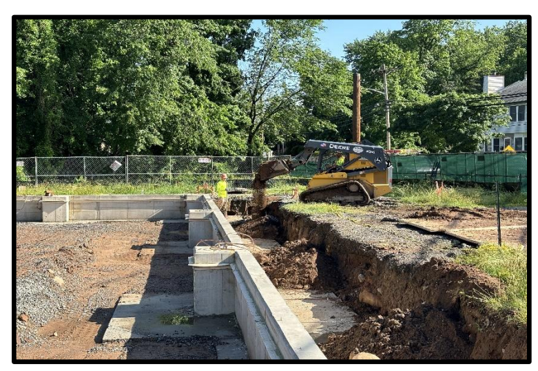
JR Prisco Backfilling Reusable Site Soils Eastside Building Foundation