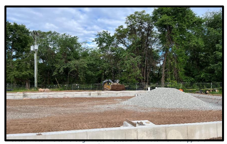
From East looking West.... backfilling soils around the building