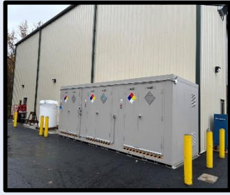
Chemical Storage Shed