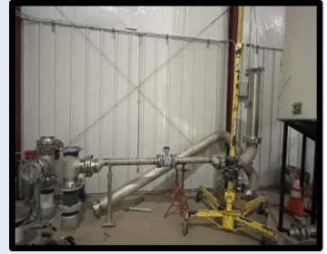
Incoming Waterline Piping