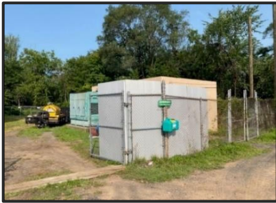
Foam boards to reduce noise from generator.