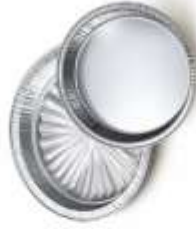
Clean Aluminum Foil and Pie Tins