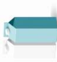
Wax Coated Cartons

NO PLASTIC BAGS OR ITEMS NOT LISTED ABOVE