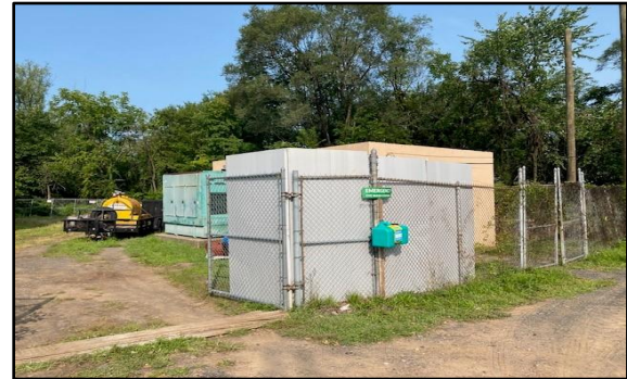
Concrete Pour for Interior Equipment Pads