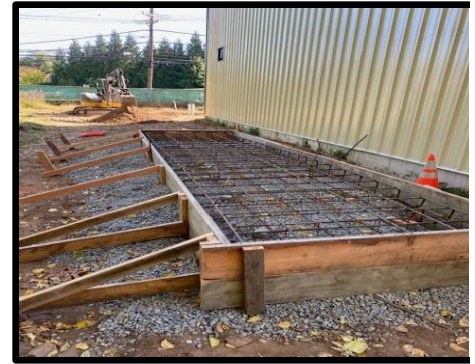
HVAC Concrete Pad Construction