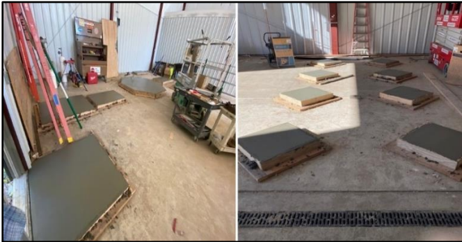
Foam boards around fence to reduce noise from generator operations.