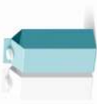
Wax Coated Cartons

NO PLASTIC BAGS OR ITEMS NOT LISTED ABOVE