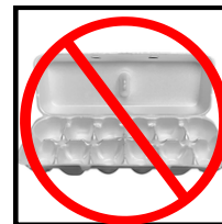
NO EGG CARTONS