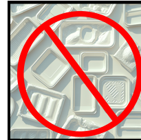
NO FOOD TRAYS or CONTAINERS