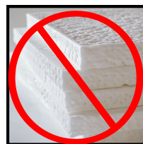
NO INSULATION FOAM PANELS