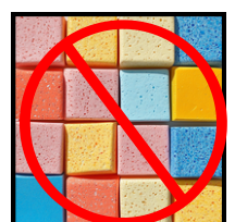
NO COLORED STYROFOAM