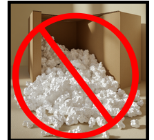
NO PACKING PEANUTS